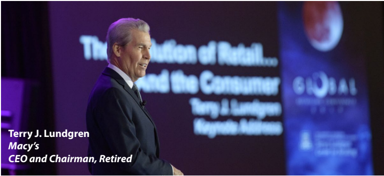
Terry J. Lundgren Macy's CEO and Chairman, Retired

The Global Retailing Ideas Summit attracts over 350 executives from retailers, brands and retail tech companies as well as university faculty and students from leading programs from across the country. This attraction is driven by insightful presentations by leading executives at companies driving change in this dynamic industry and other influential thought leaders. This high quality yet intimate event provides a great opportunity for conference sponsors to connect with this diverse and high-level group of attendees.