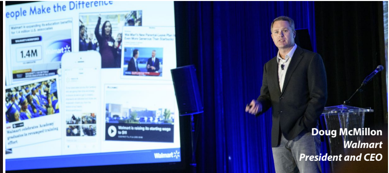
Doug McMillon Walmart President and CEO

Tucson's Sky Islands – quickly rising mountains that encircle the city – give the area one of the most unique and diverse ecosystems in the United States. The arid lowlands dominated by prickly pear, Saguaro cacti and roadrunners give way to the Sky Islands with their oak and pine trees, waterfalls, and deer and black bears escaping the blazing heat of the desert summers.